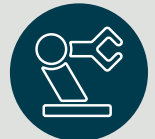
Robotic surgical equipment