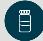
Automated pill dispensers