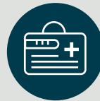
Home testing kits